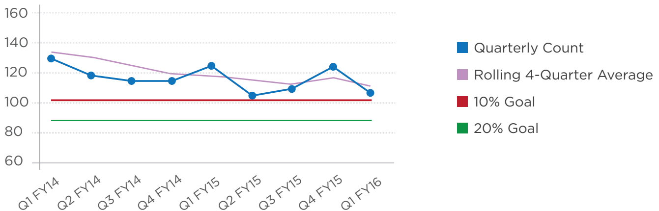
Quarterly Combined Patient & Employee Harm Events (Q1 FY16)

Our Zero Harm initiative is aimed at the eventual elimination of all patient- and employee-related harm at UI Health. For FY16, our efforts are focusing on eight types of patient-related harm and four types of employee-related harm; our FY16 goal is to achieve an overall reduction of 10 to 20 percent in the total number of these harm events from our June 2015 baseline.