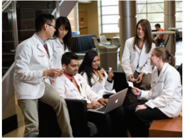
UIC College of Pharmacy

Congratulations to the UIC College of Pharmacy, College of Nursing, and College of Applied Health Sciences.