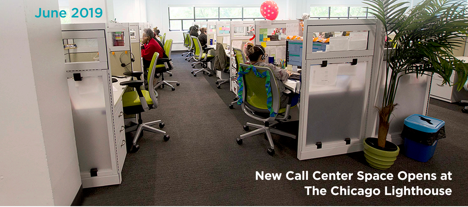
New Call Center Space Opens at The Chicago Lighthouse