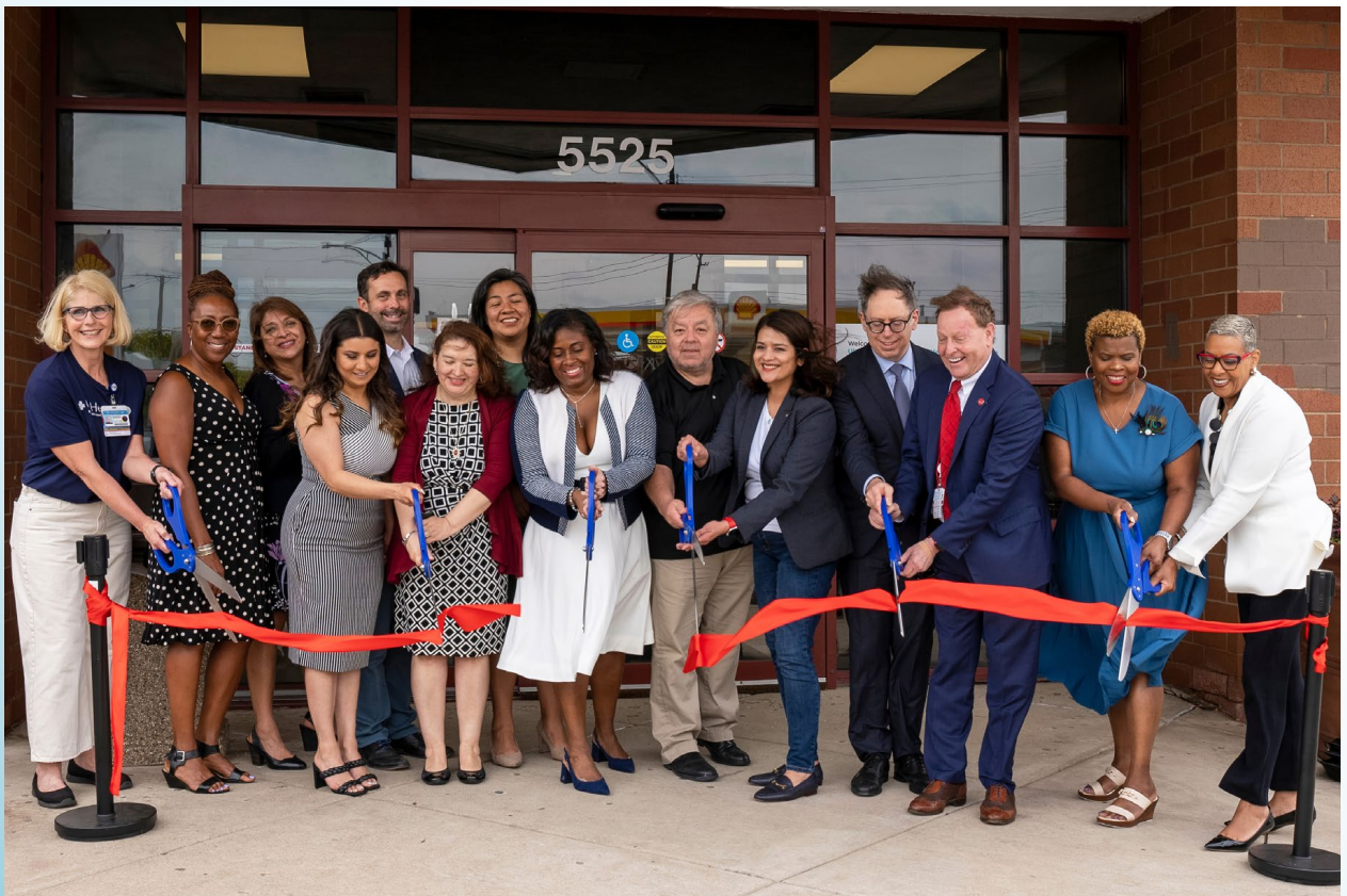
Leaders from UI Health, Alivio Medical Center, Friend Health, and the Healthcare Transformation Collaboratives initiative at the 55th & Pulaski ribbon cutting May 20.