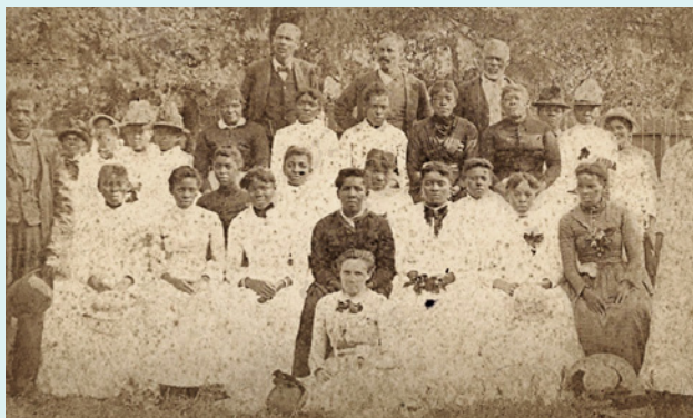
A Juneteenth celebration in Texas, 1880.

UI Health is proud to honor the Juneteenth holiday and continue our celebrations of the cultures and heritages represented by our communities, providers, and staff. ■