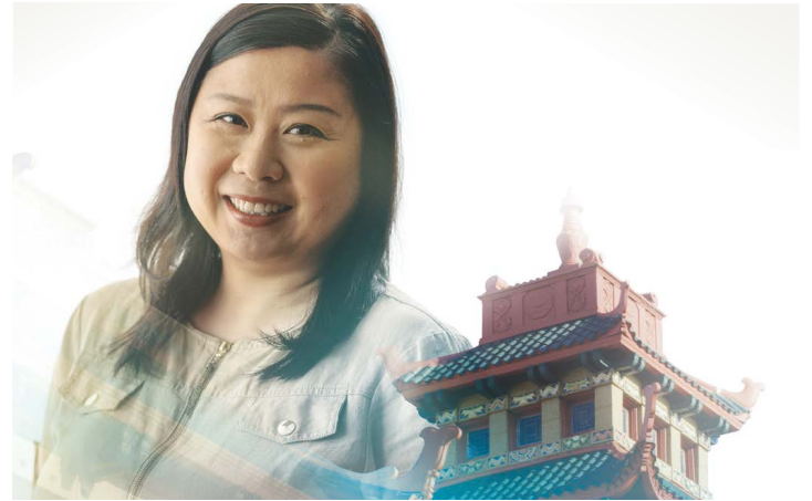
Images from the campaign highlight the diversity of the communities we serve.